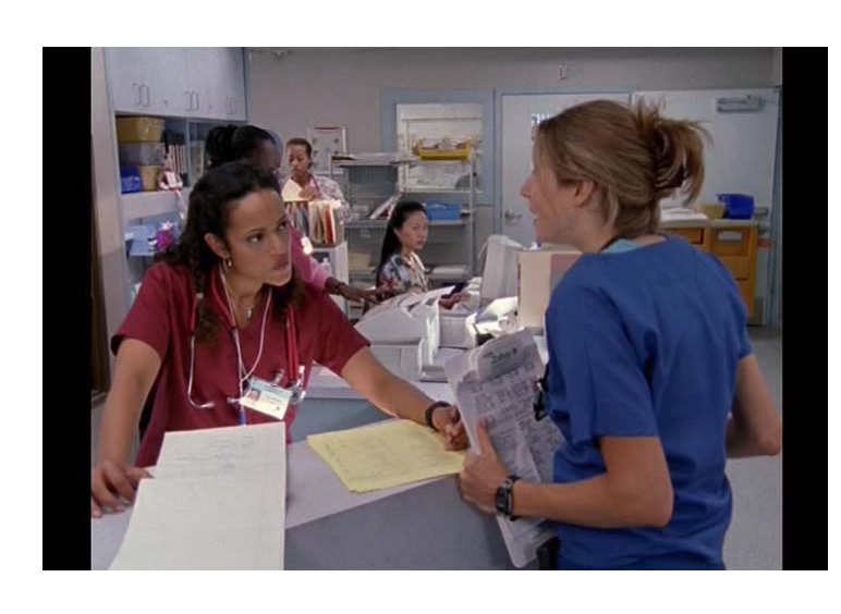
Video #I – What are we learning?