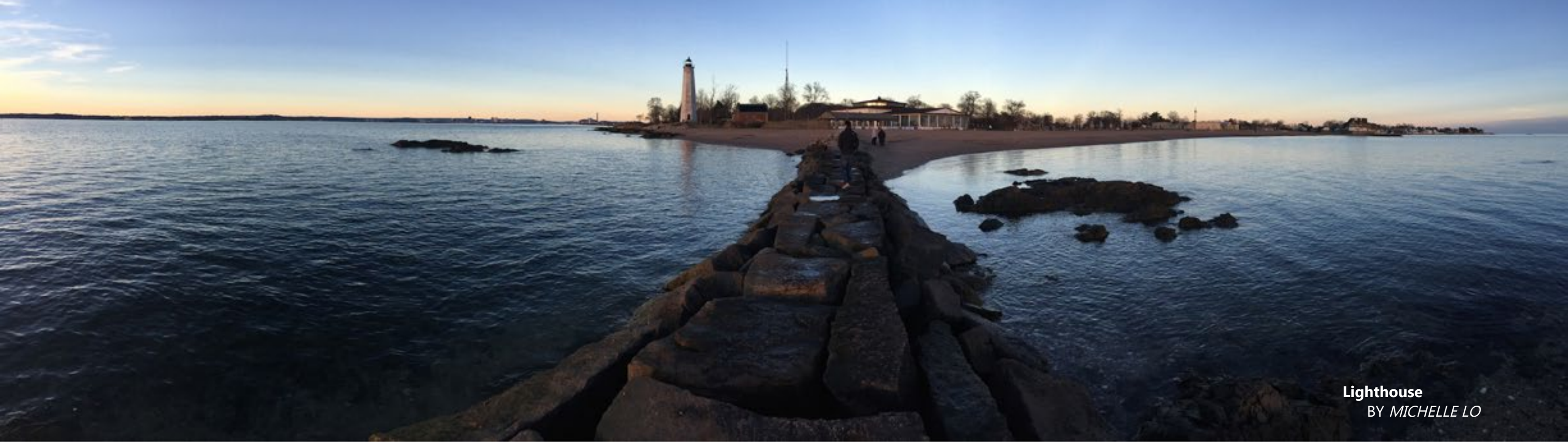
Lighthouse BY MICHELLE LO