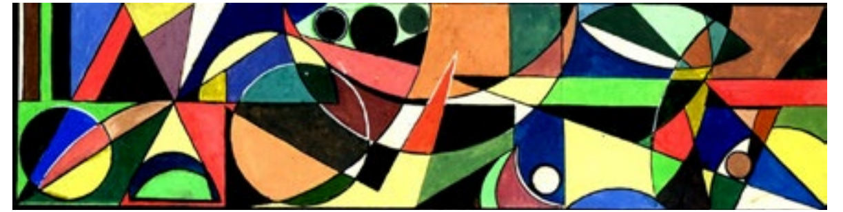
Composition 1 BY MANASH PAUL