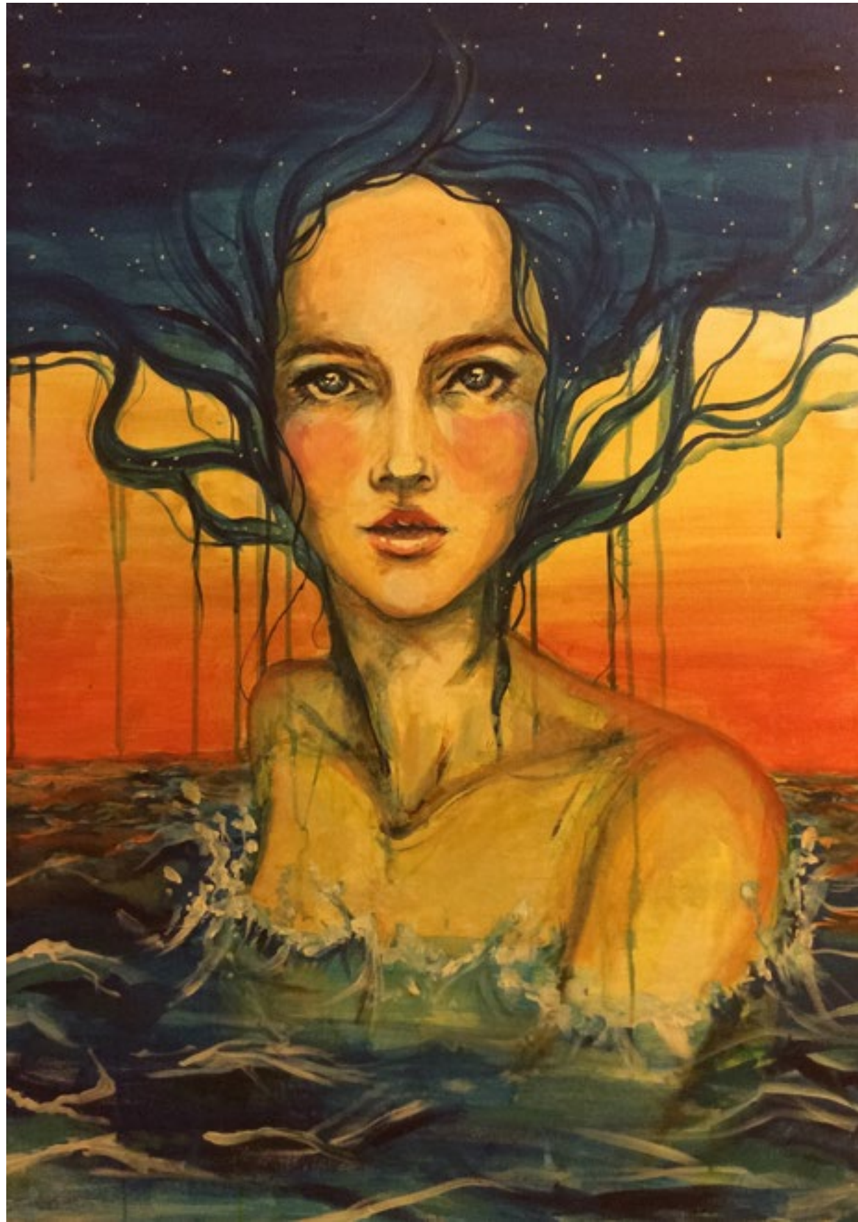
The Siren BY CINDY CHEUNG