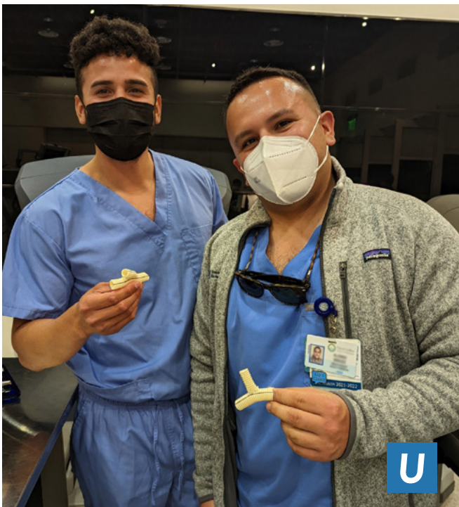
First-year medical students learned how to sew blood vessels together and fix an aortic aneurysm in a vascular surgery workshop with physicians, residents, and fellows.