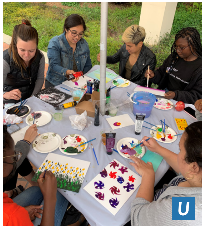
Paint & Sip night provided a relaxing study break for students to exercise their artistic talents.