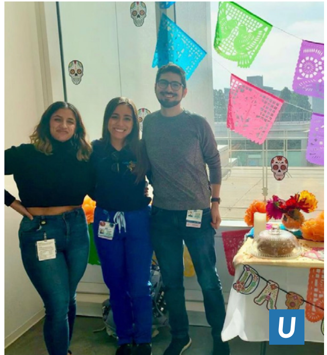
Latino Medical Student Association (LMSA) students created an altar for Día de Muertos.