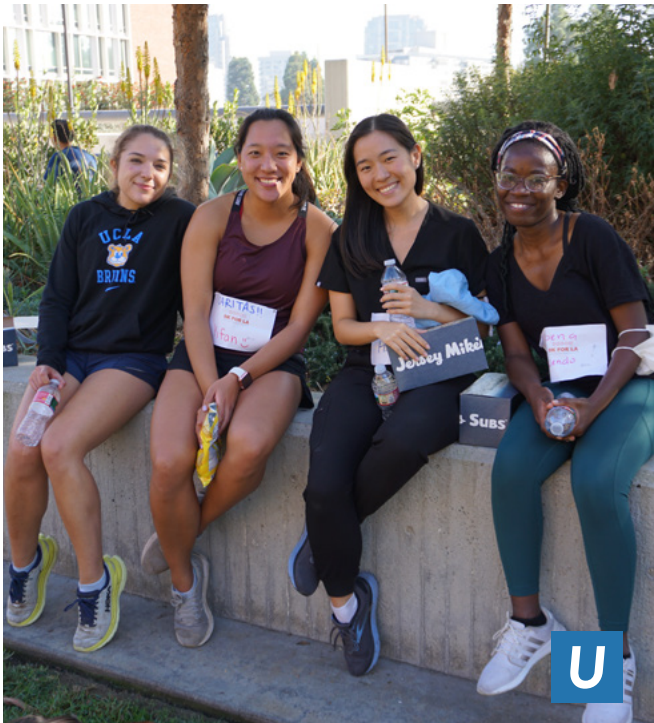
Students relax after finishing the DGSOM 5K (WALK/RUN) for LA, which raises funds to be donated to an LA-based non-profit organization.